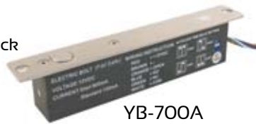
YB-700A Fail Safe

Fail Secure: Power to Open No Power - Remains Locked