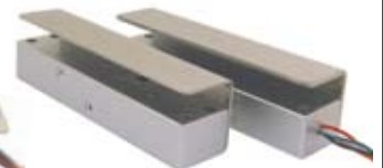
YB-500U Fail safe